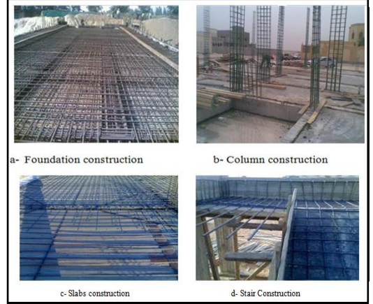
Figure 2: Different construction activities of building

We determined all quantities of required items with different lengths and diameters that are used in One- building construction for all activities of which are presented mainly four of them in the figure 2, and we have grouped their items which will cutby two workers within different durations using mechanical cutter.