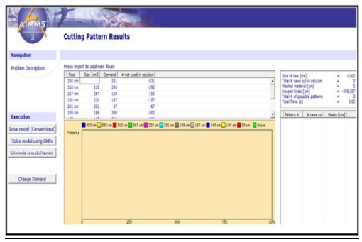
Figure 4: Data Insertion in the software system.

When the system has been opened, the scheduler need to insert data of the problems in the data table which consists of rows and columns, there are two basic rows which represent the required item lengths (finals) and the demand quantities in addition to standard stock length. This screen shows existing data which were entered to simplify the data insertion to the beginners, and the user should delete these data, and then insert our problem data by pressing insert key button for each new item should be added .